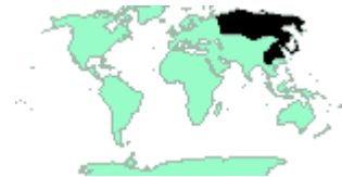
Siberia (taiga), Altai, China (Hopei - Shensi - NW.Szechuan), Sakhalin, Hokkaido, S.Kurile Islands.

Siberian Burunduk Ecureuil rayé de Sibérie Sciurus sibiricus Laxmann 1769; Altaisk Krai, Barnaul, W. Sibérie Eutamias sibiricus