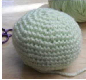
Back View of Head

Ears: Make 2. Closeup photo of Ears and Arms