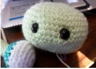
Front View of Head