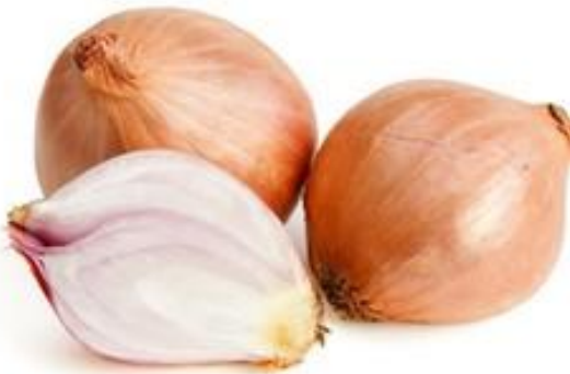
ECHALOTE - échalote