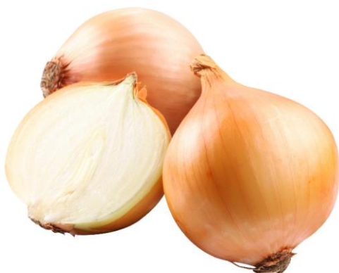
OIGNON - oignon