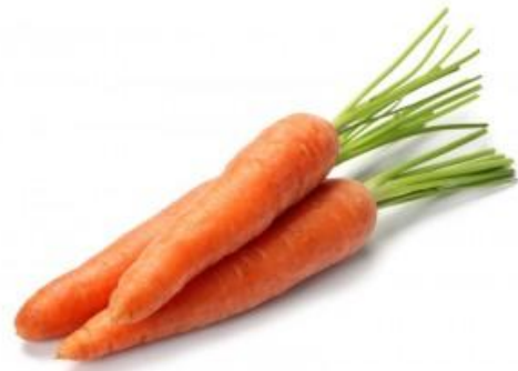
CAROTTE - carotte