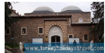
You Should Not Miss Out Any Case Of The Museum Of Anatolian Civilizations In Ankara