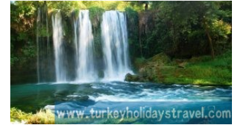
The Cool River Water Of The Düden Is A Dream In The Summer Months