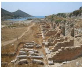
The Ancient City Of