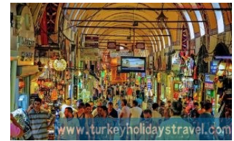
Enjoy A Tour Of The World Of Traditional Turkish Retailers At The Grand Bazaar Pera Palace Hotel