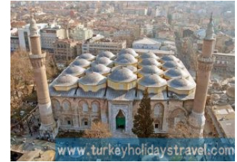
The Grand Mosque Of Bursa (Ulu Camii) Is The Central Mosque In Bursa