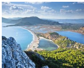
The Beach Of Iztuzu